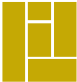
FIGURE 2. Impact of Selected Factors on Self-Reported Probability of Working Full-Time Past Age 65